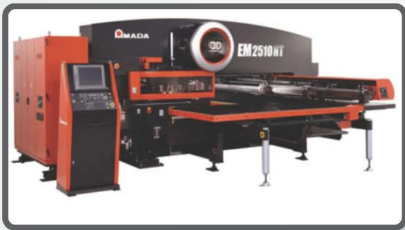
CNC Turret Punching Machine from M/S Amada