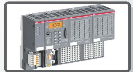
PLC AC 500