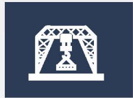
Material Handling Industry