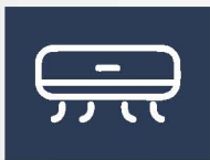
HVAC & Chiller Units