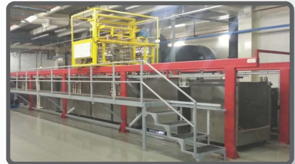
Fully Automatic 9 Tank Powder Coating Plant