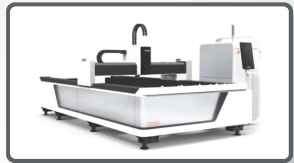
CNC Laser Cutting Machine from M/s Bodor