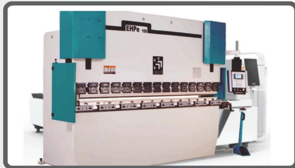
CNC Bending Machine from M/s. Hindustan Hydraulic